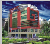
Garodia Heights, Ranchi