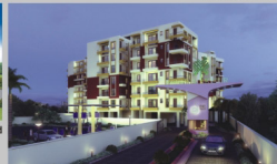
Krishna Kutir, Ramgarh