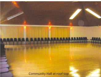
Community Hall at roof top